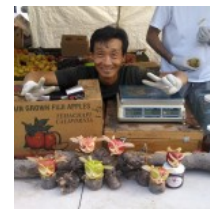
Apple Sculpture by Dale Whitney